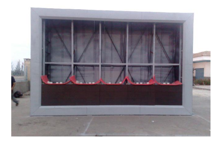
Hanging the LED display up to the roof