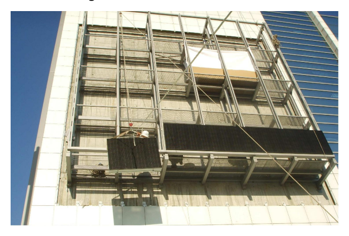
Completed LED display on the wall