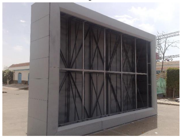
Structure frame with LED cabinet assembling